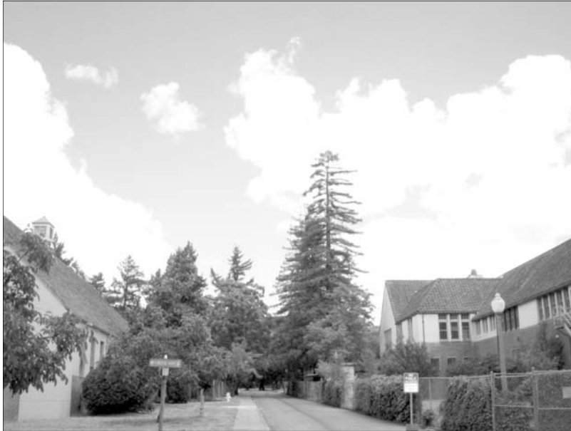
View of Wordless Hall and road towards Wonderful Enlightened Mountain.