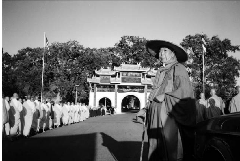
The Venerable Master presiding at Full Ordination Ceremonies.

the Sixth Patriarch's Sutra , the Buddha Speaks of Amitabha Sutra , the Sutra in Forty-Two Sections , both National Master Ch'ing Liang's Preface and Prologue , and the Chapter on the Conduct and Vows of Universal Worthy Bodhisattva from the Avatamsaka Sutra , as well as the Hundred Dharmas Shastra , and Shastra on the Awakening of Faith , and the Shramanera Vinaya .