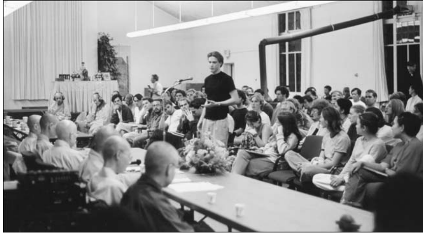
Visiting students direct questions to a panel of monks and nuns during a weekend retreat.