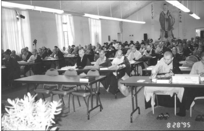
Vinaya class being held in the Dao Yuan (Source of the Way) Hall, City of Ten Thousand Buddhas.

This area provides qualified students in their fourth year of study the opportunity to apprentice in diverse aspects of monastic administration and community service. This may include classroom teaching-assistant training; learning to make curriculum aids and teaching materials; training in the management of worship halls, dormitories, libraries, and religious centers, such as temples, translation institutes, educational facilities, and retreat locations; greeting, providing for, and handling matters for guests; directing reception centers, and administering delegations and special events; counseling elementary and high school students; and offering programs that provide companionship, physical care, and moral support for the elderly. Students are assigned counselors, and each student conducts his or her training under the supervision of at least one certified instructor. Students may choose to conduct their apprenticeship on campus, or at a DRBA-authorized religious center.