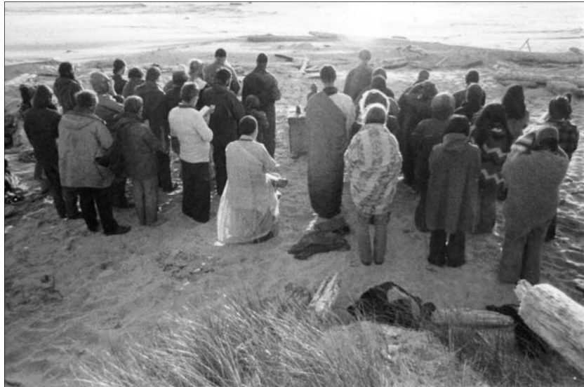
Culminating a Buddha-recitation session at Buddha Root Farm in Oregon, the Master and participants perform the Great Transference of merit on the shores of the Pacific at Sunset.