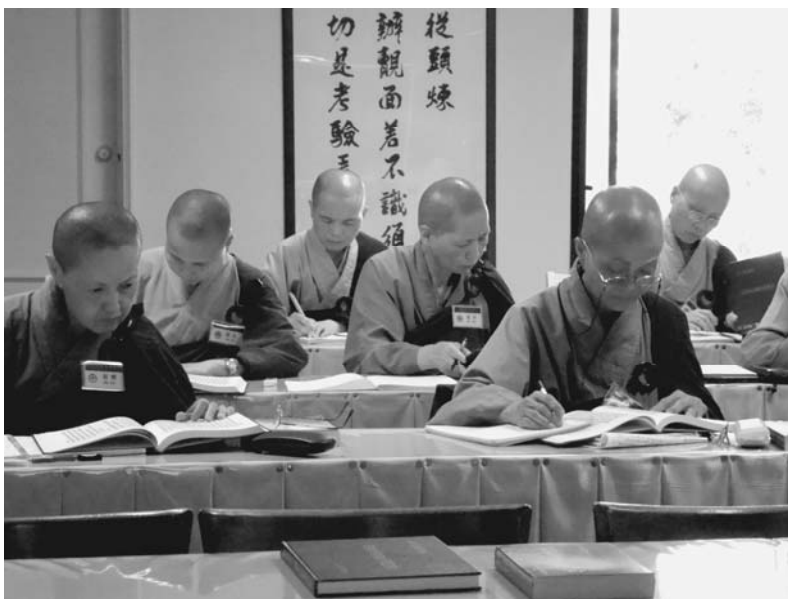
Sangha students studying and memorizing Vinaya texts.

The classroom instructor monitors the students' progress by observation of attendance, attentiveness, participation in the class format, and completion of assignments. A letter grade is assigned, indicating comprehension of the content covered in the class. Clock hours are earned as recorded on attendance records. Trainees who wish to take Dharma Realm Buddhist University classes for clock-hour and letter-grade credit in the Sangha or Laity Training Program, must complete a Special Studies Form, get the instructor's signature and then pass the form to the Registrar's Office.