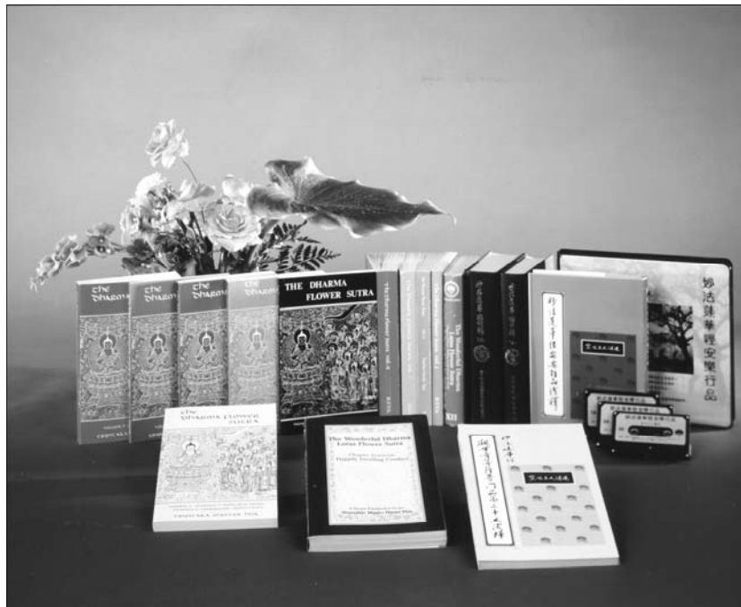
Books and Audio Tapes Published by the Buddhist Text Translation Society.

Recommended Readings: To be arranged by instructor.