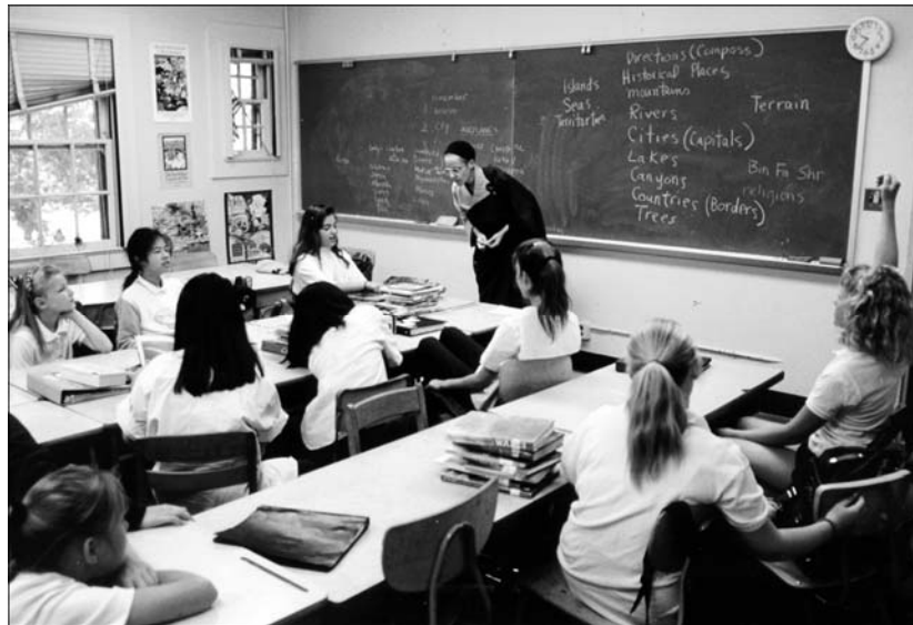
Developing Virtue Girls' School students during an in-class discussion led by an ordained nun.

Instilling Goodness Elementary School and Developing Virtue Secondary School, have been operating at the City of Ten Thousand Buddhas since 1973 and 1976 respectively. The Association also sponsors intensive retreats and meditation sessions; daily lectures on the Buddhist Sutras; and, periodic ordinations of Bhikshus and Bhikshunis (monks and nuns) into the orthodox Buddhist Sangha. The Association publishes the Buddhist monthly journal, Vajra Bodhi Sea.