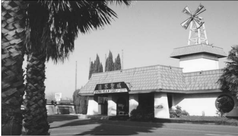
Entrance to the worship hall, City of the Dharma Realm, West Sacramento.