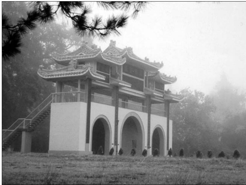
Entrance to the City of Ten Thousand Buddhas.