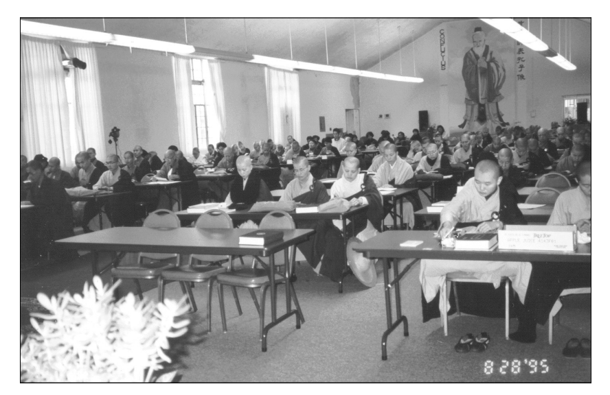
Vinaya class being held in the Dao Yuan (Source of the Way) Hall, City of Ten Thousand Buddhas.

This area provides qualified students in their fourth year of study the opportunity to apprentice in diverse aspects of monastic administration and community service. This may include classroom teaching-assistant training; learning to make curriculum aids and teaching materials; training in the management of worship halls, dormitories, libraries, and religious centers, such as temples, translation institutes, educational facilities, and retreat locations; greeting, providing for, and handling matters for guests; directing reception centers, and administering delegations and special events; counseling elementary and high school students; and offering programs that provide companionship, physical care, and moral support for the elderly. Students are assigned counselors, and each student conducts his or her training under the supervision of at least one certified instructor. Students may choose to conduct their apprenticeship on campus, or at a DRBA-authorized religious center.