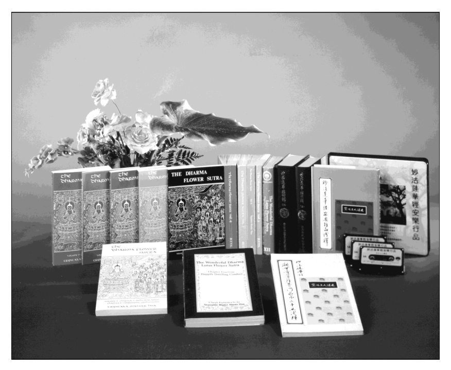
Books and Audio Tapes Published by the Buddhist Text Translation Society.

Recommended Readings: To be arranged by instructor.