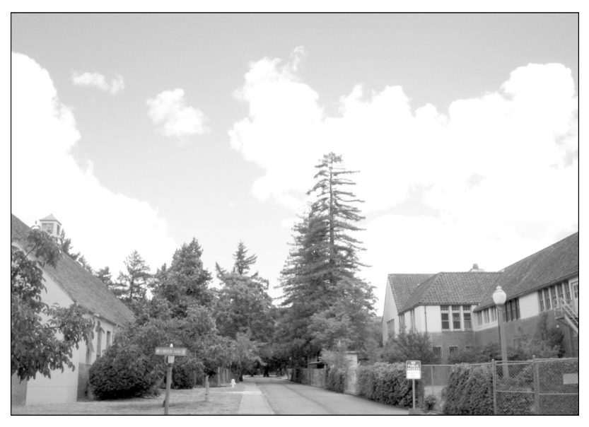
View of Wordless Hall and road towards Wonderful Enlightened Mountain.