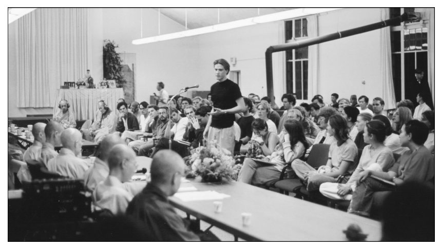
Visiting students direct questions to a panel of monks and nuns during a weekend retreat.