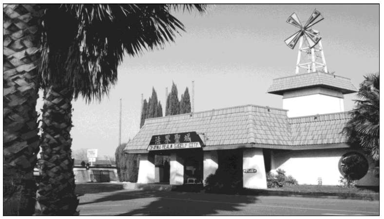
Entrance to the worship hall, City of the Dharma Realm, West Sacramento.