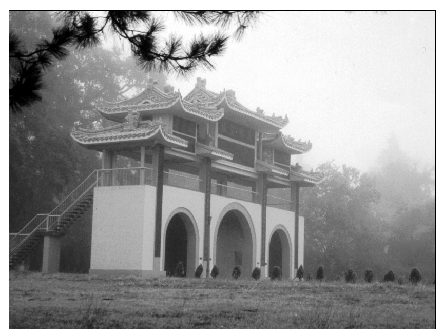
Entrance to the City of Ten Thousand Buddhas.