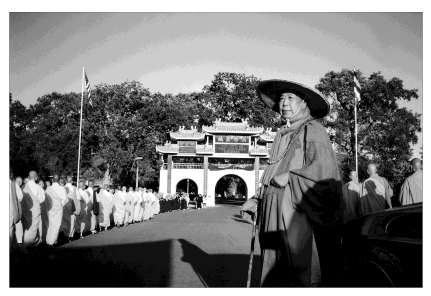
The Venerable Master presiding at Full Ordination Ceremonies.

tamsaka Sutra, as well as the Hundred Dharmas Shastra, and Shastra on the Awakening of Faith, and the Shramanera Vinaya.