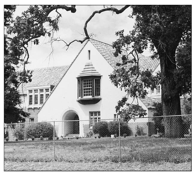
The City of Ten Thousand Buddha's permanent precept platform is housed in Wisdom Hall.

Beginning: Elementary Sanskrit. Recognition of Devanagari and fundamental principles of grammar. Intermediate: Use of dictionaries. Principles of grammar. Readings. Advanced: Reading of selected Sanskrit texts.