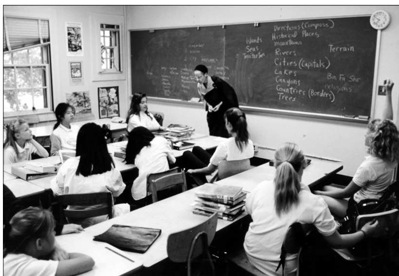
Developing Virtue Girls' School students during an in-class discussion led by an ordained nun.

Instilling Goodness Elementary School and Developing Virtue Secondary School, have been operating at the City of Ten Thousand Buddhas since 1973 and 1976 respectively. The Association also sponsors intensive retreats and meditation sessions; daily lectures on the Buddhist Sutras; and, periodic ordinations of Bhikshus and Bhikshunis (monks and nuns) into the orthodox Buddhist Sangha. The Association publishes the Buddhist monthly journal, Vajra Bodhi Sea.