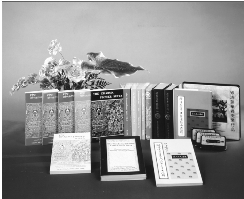
Books and Audio Tapes Published by the Buddhist Text Translation Society.

Recommended Readings: To be arranged by instructor.