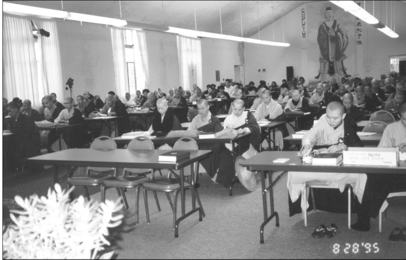
Vinaya class being held in the Dao Yuan (Source of the Way) Hall, City of Ten Thousand Buddhas.

This area provides qualified students in their fourth year of study the opportunity to apprentice in diverse aspects of monastic administration and community service. This may include classroom teaching-assistant training; learning to make curriculum aids and teaching materials; training in the management of worship halls, dormitories, libraries, and religious centers, such as temples, translation institutes, educational facilities, and retreat locations; greeting, providing for, and handling matters for guests; directing reception centers, and administering delegations and special events; counseling elementary and high school students; and offering programs that provide companionship, physical care, and moral support for the elderly. Students are assigned counselors, and each student conducts his or her training under the supervision of at least one certified instructor. Students may choose to conduct their apprenticeship on campus, or at a DRBA-authorized religious center.