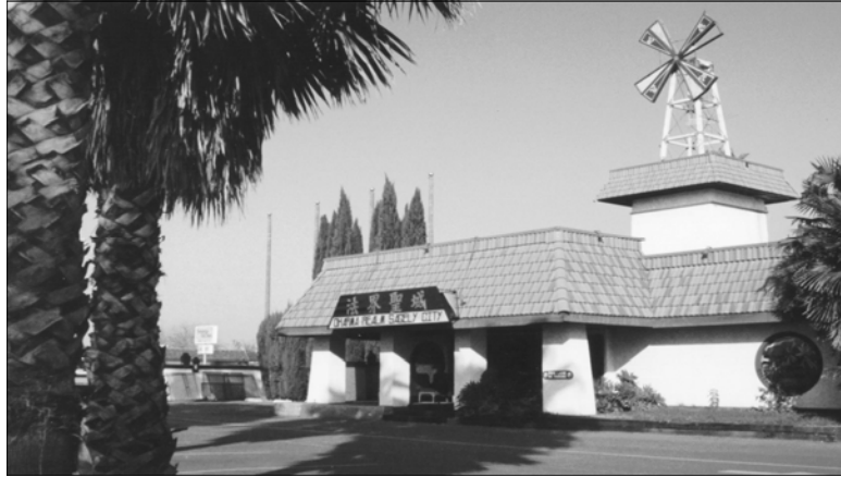
Entrance to the worship hall, City of the Dharma Realm, West Sacramento.