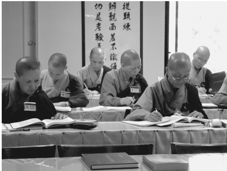
Sangha students studying and memorizing Vinaya texts.

The classroom instructor monitors the students' progress by observation of attendance, attentiveness, participation in the class format, and completion of assignments. A letter grade is assigned, indicating comprehension of the content covered in the class. Clock hours are earned as recorded on attendance records. Trainees who wish to take Dharma Realm Buddhist University classes for clock-hour and letter-grade credit in the Sangha or Laity Training Program, must complete a Special Studies Form, get the instructor's signature and then pass the form to the Registrar's Office.