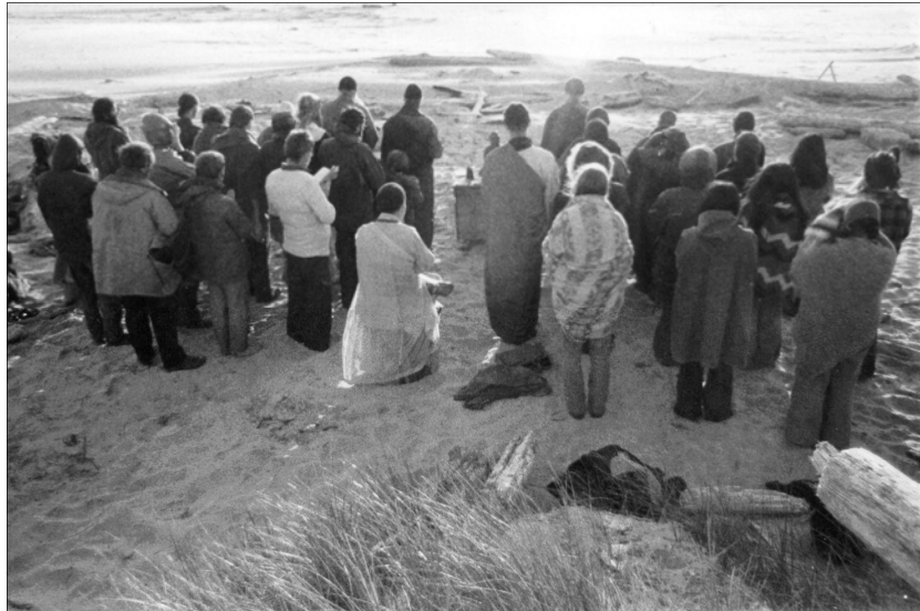
Culminating a Buddha-recitation session at Buddha Root Farm in Oregon, the Master and participants perform the Great Transference of merit on the shores of the Pacific at Sunset.

In June, 1995, not having paused to rest his entire life, the Venerable Master Hua entered Nirvana.