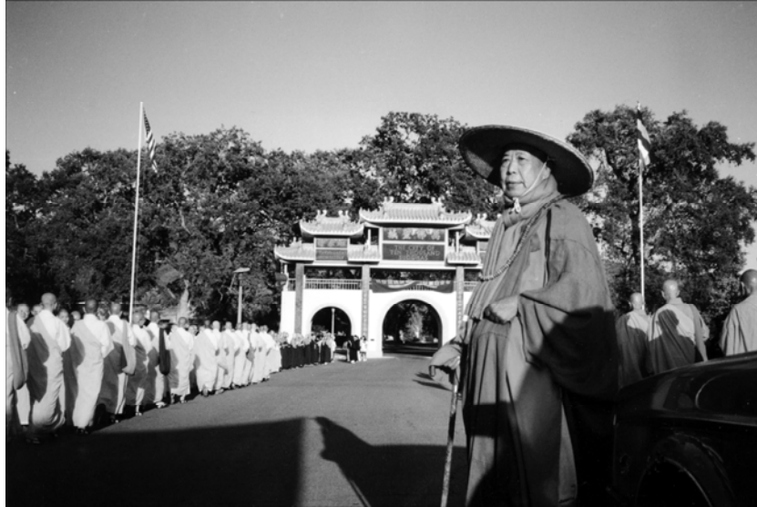
The Venerable Master presiding at Full Ordination Ceremonies.

the Sixth Patriarch's Sutra , the Buddha Speaks of Amitabha Sutra , the Sutra in Forty-Two Sections , both National Master Ch'ing Liang's Preface and Prologue , and the Chapter on the Conduct and Vows of Universal Worthy Bodhisattva from the Avatamsaka Sutra , as well as the Hundred Dharmas Shastra , and Shastra on the Awakening of Faith , and the Shramanera Vinaya .