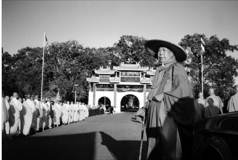
The Venerable Master presiding at Full Ordination Ceremonies.

the Sixth Patriarch's Sutra , the Buddha Speaks of Amitabha Sutra , the Sutra in Forty-Two Sections , both National Master Ch'ing Liang's Preface and Prologue , and the Chapter on the Conduct and Vows of Universal Worthy Bodhisattva from the Avatamsaka Sutra , as well as the Hundred Dharmas Shastra , and Shastra on the Awakening of Faith , and the Shramanera Vinaya .