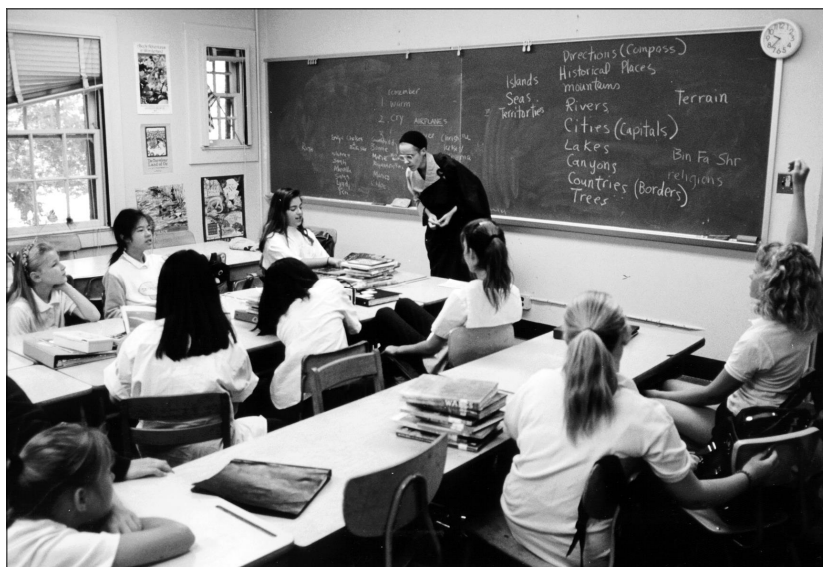
Developing Virtue Girls' School students during an in-class discussion led by an ordained nun.

Instilling Goodness Elementary School and Developing Virtue Secondary School, have been operating at the City of Ten Thousand Buddhas since 1973 and 1976 respectively. The Association also sponsors intensive retreats and meditation sessions; daily lectures on the Buddhist Sutras; and, periodic ordinations of Bhikshus and Bhikshunis (monks and nuns) into the orthodox Buddhist Sangha. The Association publishes the Buddhist monthly journal, Vajra Bodhi Sea.