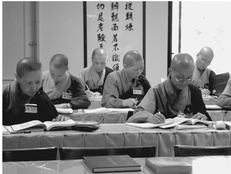
Sangha students studying and memorizing Vinaya texts.

The classroom instructor monitors the students' progress by observation of attendance, attentiveness, participation in the class format, and completion of assignments. A letter grade is assigned, indicating comprehension of the content covered in the class. Clock hours are earned as recorded on attendance records. Trainees who wish to take Dharma Realm Buddhist University classes for clock-hour and letter-grade credit in the Sangha or Laity Training Program, must complete a Special Studies Form, get the instructor's signature and then pass the form to the Registrar's Office.