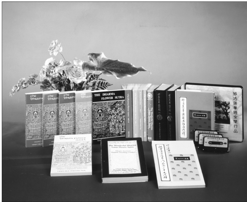
Books and Audio Tapes Published by the Buddhist Text Translation Society.

Recommended Readings: To be arranged by instructor.