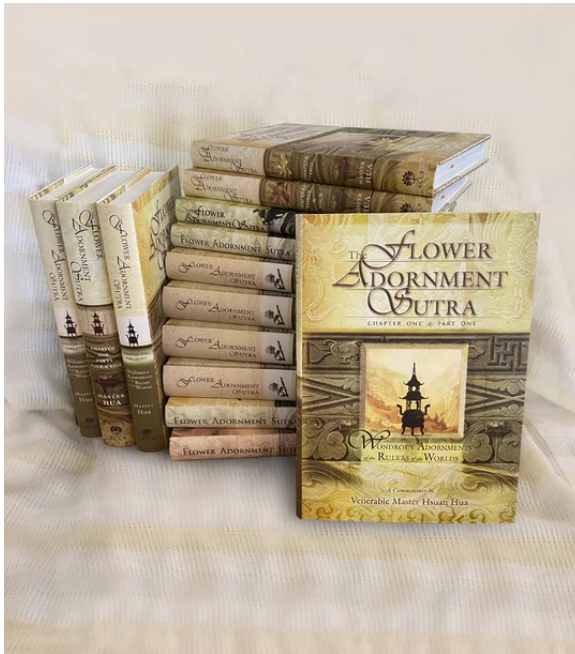
Books Published by the Buddhist Text Translation Society.

Recommended Readings: To be arranged by instructor.