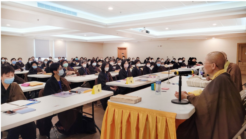
Laity students engaging in precept class.

The classroom instructor monitors the students' progress by observation of attendance, attentiveness, participation in the class format, and completion of assignments. A letter grade is assigned, indicating comprehension of the content covered in the class. Clock hours are earned as recorded on attendance records. Students who wish to take Dharma Realm Buddhist University classes for clock-hour and letter-grade credit in the Sangha or Laity Training Program, must complete a Special Studies Form, get the instructor's signature and then pass the form to the Registrar's Office.