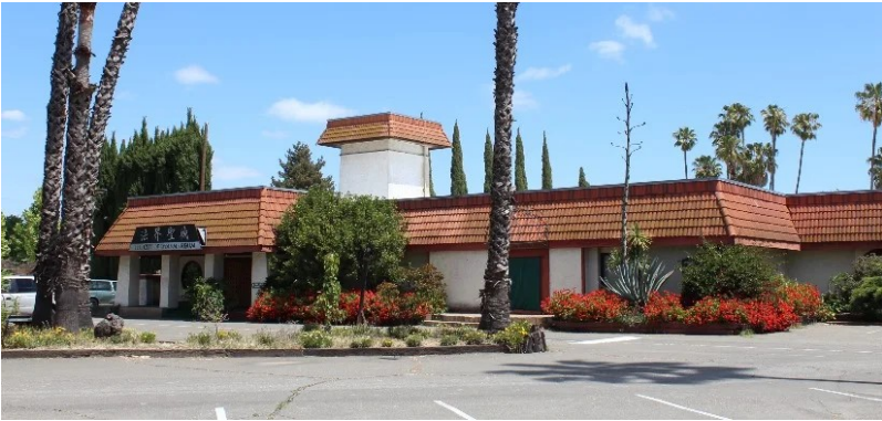
Entrance to the worship hall, City of the Dharma Realm, West Sacramento.