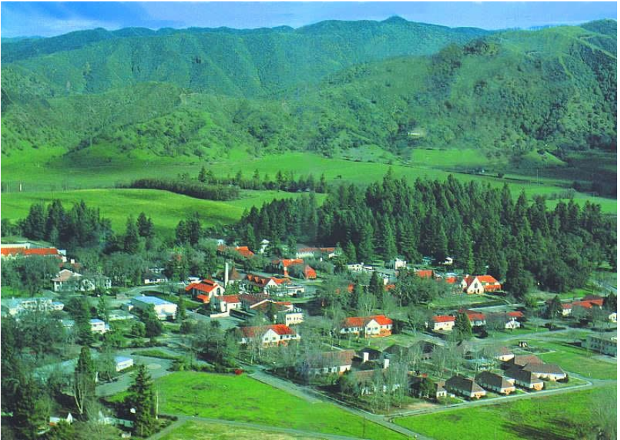
Aerial view of the City of Ten Thousand Buddhas.

Instilling Goodness Elementary School and Developing Virtue Secondary School, have been operating at the City of Ten Thousand Buddhas since 1973 and 1976 respectively. The Association also sponsors intensive retreats and meditation sessions; daily lectures on the Buddhist Sutras; and, periodic ordinations of Bhikshus and Bhikshunis (monks and nuns) into the orthodox Buddhist Sangha. The Association publishes the Buddhist monthly journal, Vajra Bodhi Sea.