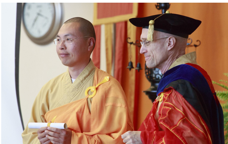
Sangha graduate participating in the Commencement Ceremony.

A Sangha or Laity Training diploma is awarded at the successful completion of the total number of clock hours required for the course of Training for which the student enrolled; this usually takes four years.