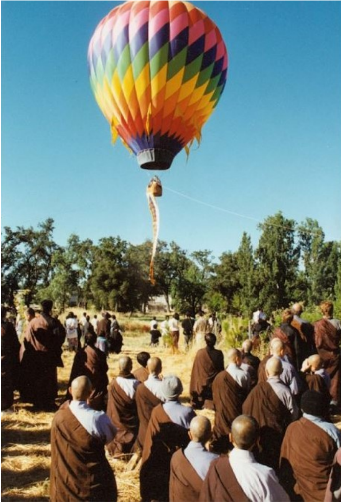
The Venerable Master's ashes were dispersed into empty space from a hot air balloon.

In June, 1995, not having paused to rest his entire life, the Venerable Master Hua entered Nirvana.