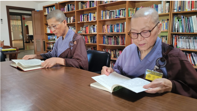
Students studying in the library, City of Dharma Realm.