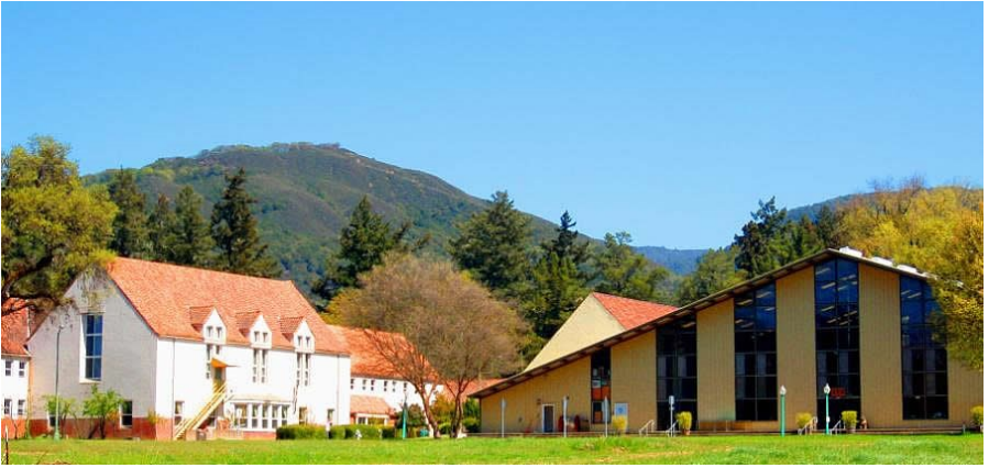
Wonderful Enlightenment Mountain in the background of Tathagata Monastery, City of Ten Thousand Buddhas.

Monastery, Long Beach, California; Founder, Avatamsaka Hermitage, Bethesda, Maryland; Founder, Proper Dharma Buddhist Academy for Women, Hua Lien, Taiwan, 1989; Founder and Director of Dharma Realm Buddhist Books Distribution Center, Taipei, Taiwan.