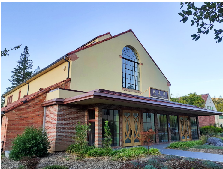
Front view of Earth Treasury Hall, City of Ten Thousand Buddhas.