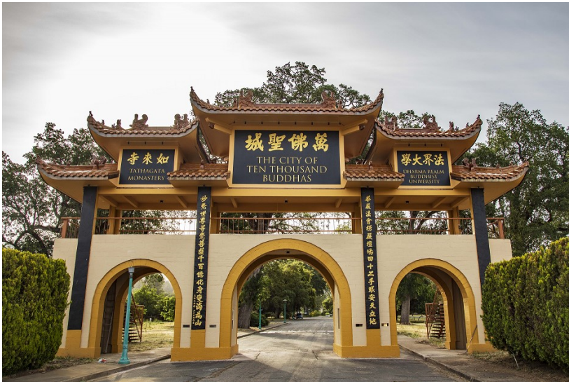
Entrance to the City of Ten Thousand Buddhas.