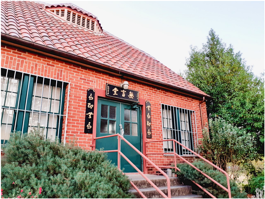
Front view of Wordless Hall, City of Ten Thousand Buddhas.

tamsaka Sutra , as well as the Hundred Dharmas Shastra , and Sbastra on the Awakening of Faith , and the Shramanera Vinaya .