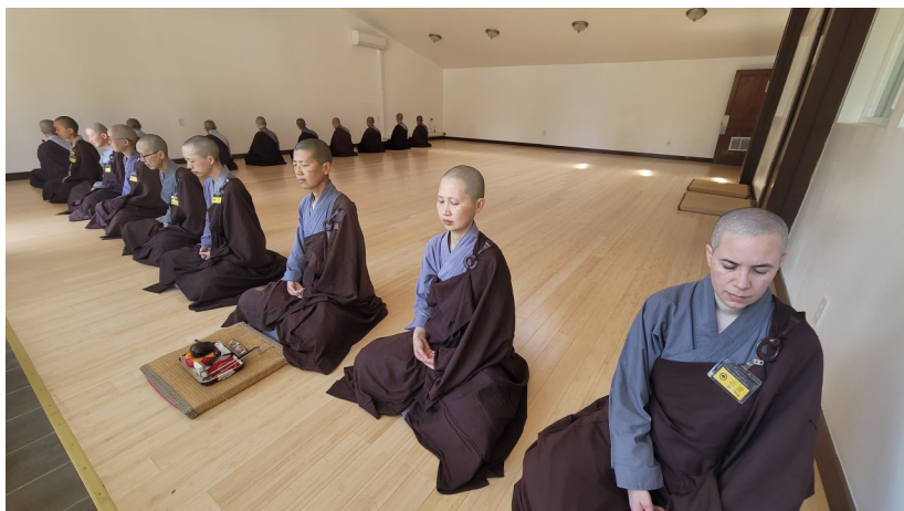
Students sitting in meditation in the Chan Hall, City of Dharma Realm.