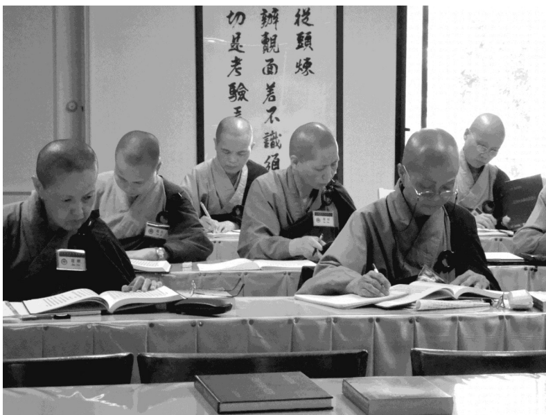
Sangha students studying and memorizing Vinaya texts.

The classroom instructor monitors the students' progress by observation of attendance, attentiveness, participation in the class format, and completion of assignments. A letter grade is assigned, indicating comprehension of the content covered in the class. Clock hours are earned as recorded on attendance records. Trainees who wish to take Dharma Realm Buddhist University classes for clock-hour and letter-grade credit in the Sangha or Laity Training Program, must complete a Special Studies Form, get the instructor's signature and then pass the form to the Registrar's Office.