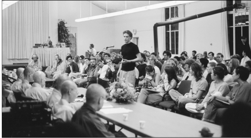
Visiting students direct questions to a panel of monks and nuns during a weekend retreat.