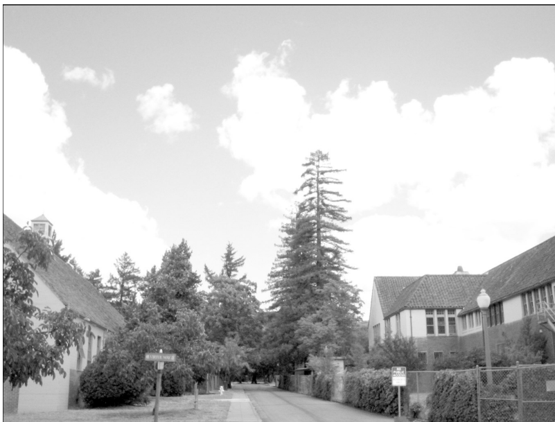
View of Wordless Hall and road towards Wonderful Enlightened Mountain.