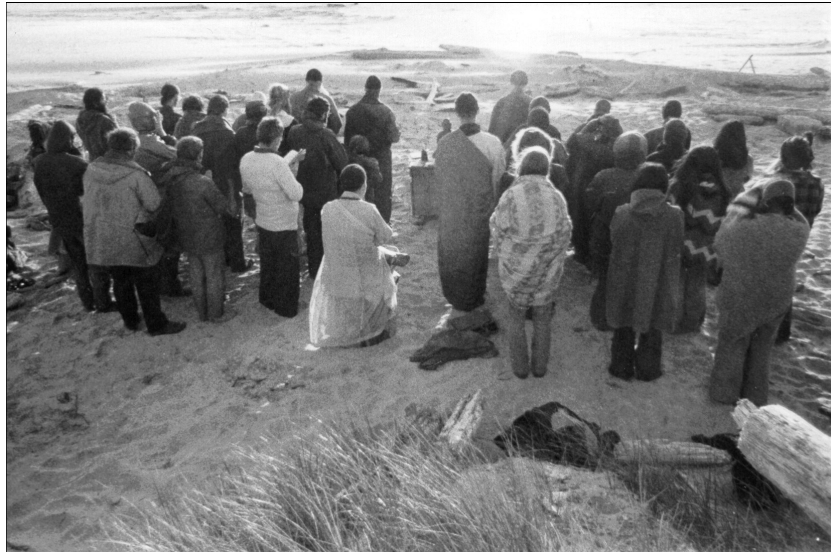
Culminating a Buddha-recitation session at Buddha Root Farm in Oregon, the Master and participants perform the Great Transference of merit on the shores of the Pacific at Sunset.

In June, 1995, not having paused to rest his entire life, the Venerable Master Hua entered Nirvana.