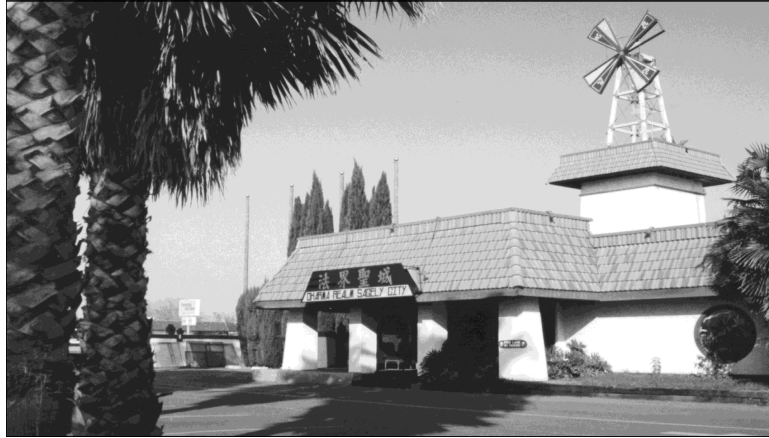
Entrance to the worship hall, City of the Dharma Realm, West Sacramento.