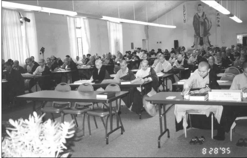
Vinaya class being held in the Dao Yuan (Source of the Way) Hall, City of Ten Thousand Buddhas.

This area provides qualified students in their fourth year of study the opportunity to apprentice in diverse aspects of monastic administration and community service. This may include classroom teaching-assistant training; learning to make curriculum aids and teaching materials; training in the management of worship halls, dormitories, libraries, and religious centers, such as temples, translation institutes, educational facilities, and retreat locations; greeting, providing for, and handling matters for guests; directing reception centers, and administering delegations and special events; counseling elementary and high school students; and offering programs that provide companionship, physical care, and moral support for the elderly. Students are assigned counselors, and each student conducts his or her training under the supervision of at least one certified instructor. Students may choose to conduct their apprenticeship on campus, or at a DRBA-authorized religious center.