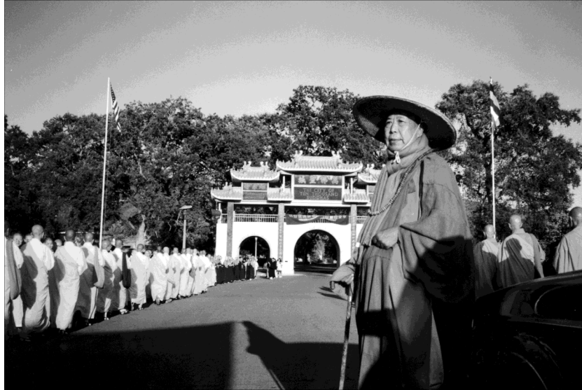
The Venerable Master presiding at Full Ordination Ceremonies.

the Sixth Patriarch's Sutra , the Buddha Speaks of Amitabha Sutra , the Sutra in Forty-Two Sections , both National Master Ch'ing Liang's Preface and Prologue , and the Chapter on the Conduct and Vows of Universal Worthy Bodhisattva from the Avatamsaka Sutra , as well as the Hundred Dharmas Shastra , and Shastra on the Awakening of Faith , and the Shramanera Vinaya .