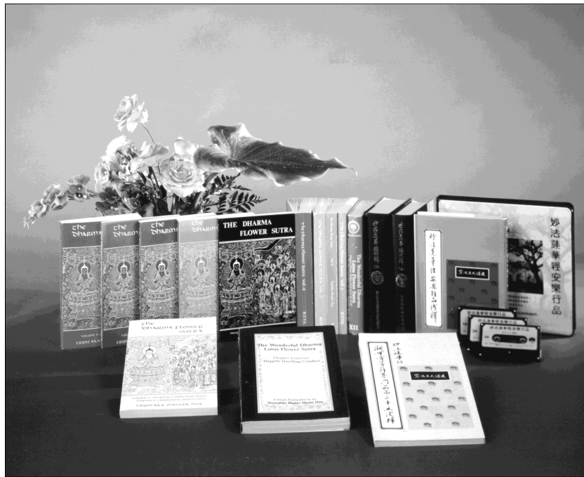
Books and Audio Tapes Published by the Buddhist Text Translation Society.

Recommended Readings: To be arranged by instructor.