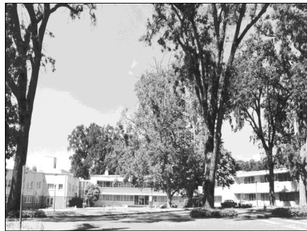
Tower of Blessings Home for the Elderly and CTTB Medical & Dental clinics.

The Sangha & Laity Training Programs are authorized by the U.S. Department of Immigration and Customs Enforcement [ICE] to admit non-immigrant foreign students. The Registrar's Department will provide information and an I-20 application for a foreign student visa [F-1] at no cost to the student; however, the student will be responsible for the costs of their own visa filing fees and postage. SLTP does not admit undocumented students. It is expected that graduates of SLTP will return to their own countries to pursue their vocations; moreover, student visas do not lead to permanent residency in the United States.