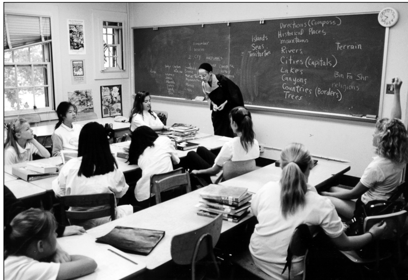
Developing Virtue Girls' School students during an in-class discussion led by an ordained nun.

Instilling Goodness Elementary School and Developing Virtue Secondary School, have been operating at the City of Ten Thousand Buddhas since 1973 and 1976 respectively. The Association also sponsors intensive retreats and meditation sessions; daily lectures on the Buddhist Sutras; and, periodic ordinations of Bhikshus and Bhikshunis (monks and nuns) into the orthodox Buddhist Sangha. The Association publishes the Buddhist monthly journal, Vajra Bodhi Sea.