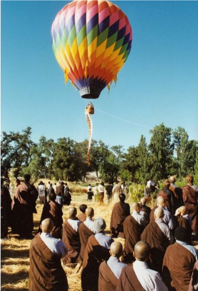
The Venerable Master's ashes were dispersed into empty space from a hot air balloon.

In June, 1995, not having paused to rest his entire life, the Venerable Master Hua entered Nirvana.