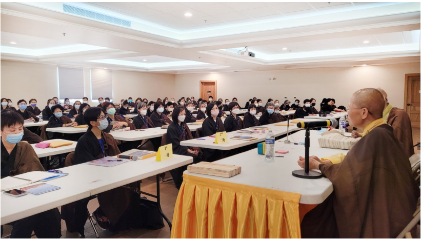
Laity students engaging in precept class.

The classroom instructor monitors the students' progress by observation of attendance, attentiveness, participation in the class format, and completion of assignments. A letter grade is assigned, indicating comprehension of the content covered in the class. Clock hours are earned as recorded on attendance records. Students who wish to take Dharma Realm Buddhist University classes for clock-hour and letter-grade credit in the Sangha or Laity Training Program,