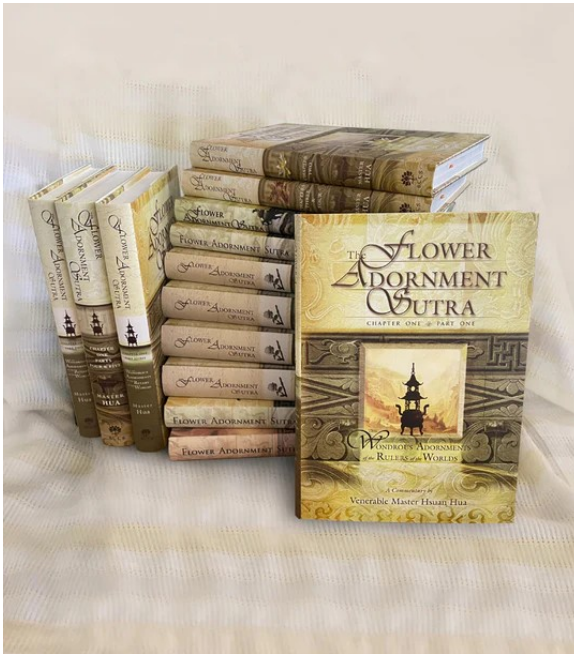
Books Published by the Buddhist Text Translation Society.

Listen to Yourself, Think Everything Over ,