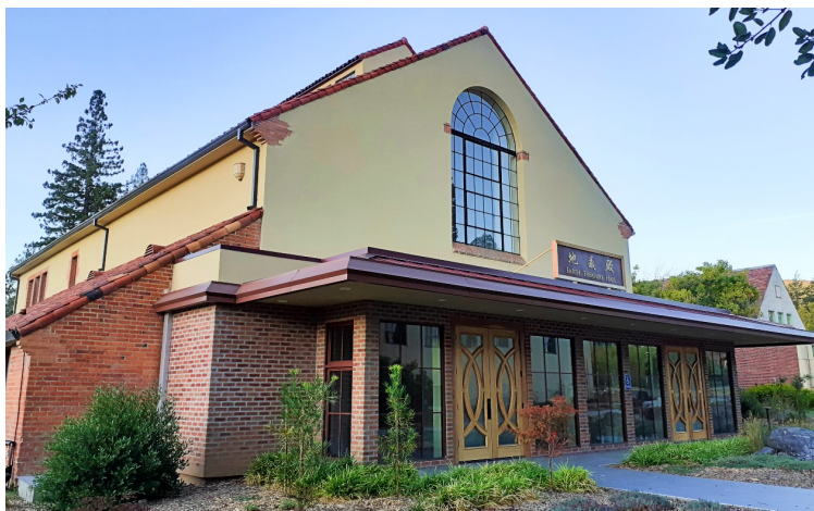
Front view of Earth Treasury Hall, City of Ten Thousand Buddhas.