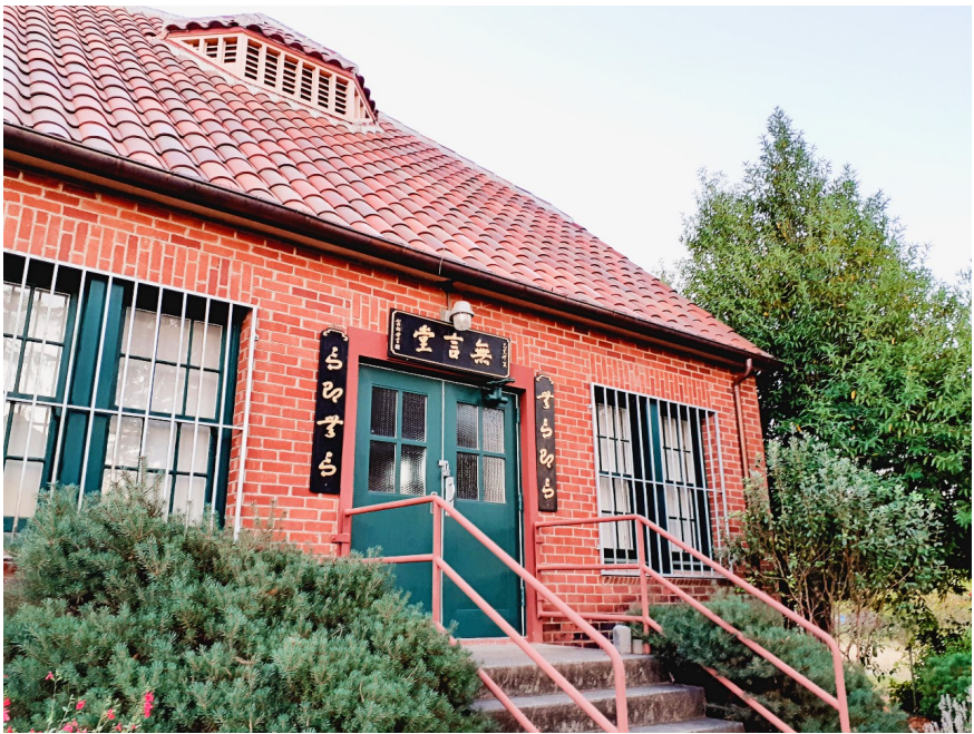
Front view of Wordless Hall, City of Ten Thousand Buddhas.

tamsaka Sutra , as well as the Hundred Dharmas Shastra , and Sbastra on the Awakening of Faith , and the Shramanera Vinaya .